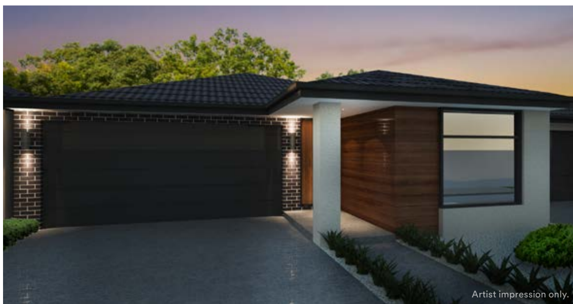
Artist impression only.