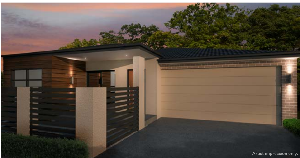
Artist impression only.